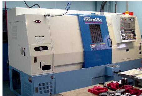
(Kia Turn 21LS)