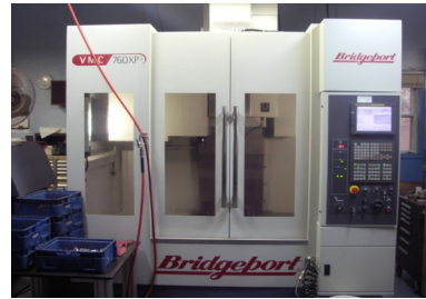
(Bridgeport VMC 760XP)