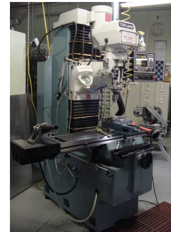
(Trak Bed Mill)